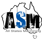
All State Machining P/L