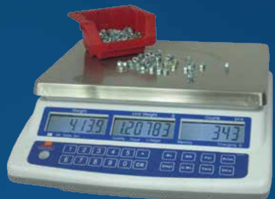
Wombat Counting Scale