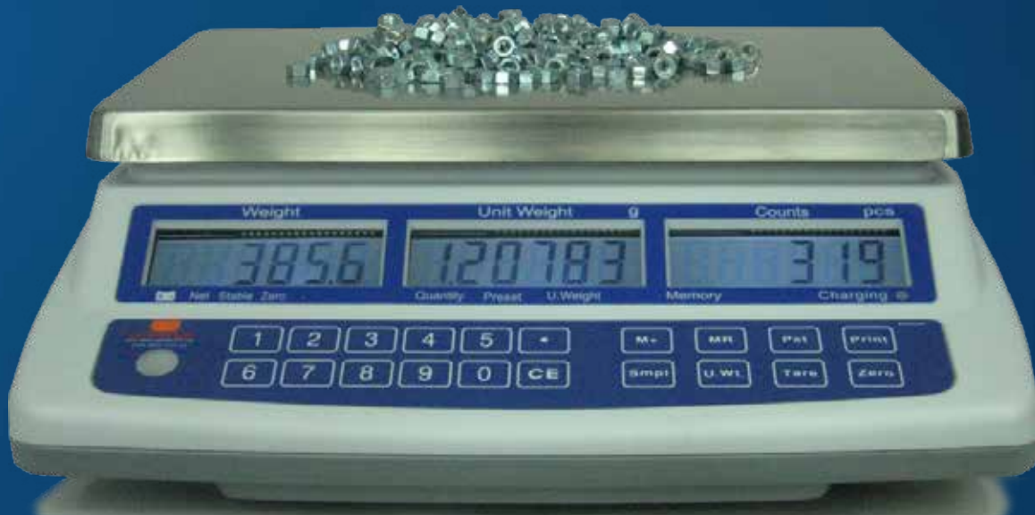
Wombat Counting Scale