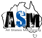
All State Machining P/L