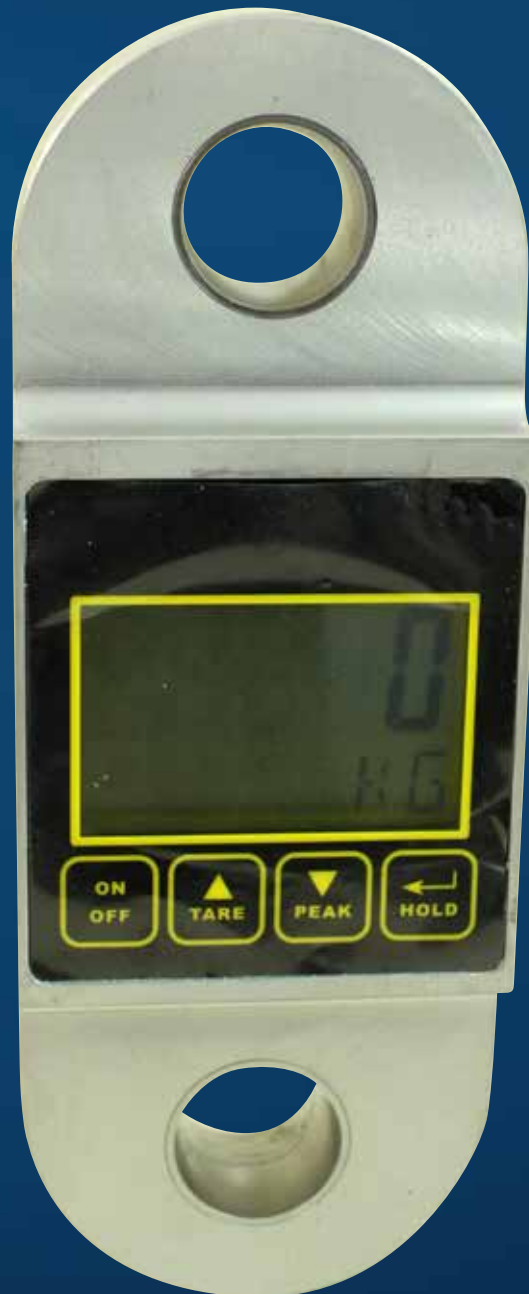
ACSI Crane Scale